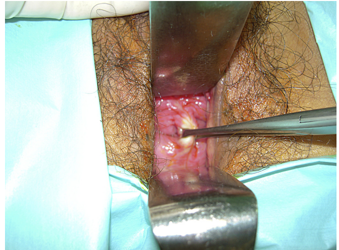
Fig. 2. The vertical vaginal band can be pulled out easily by a grasper.

Dyspareunia has been one of the concerns associated with the use of synthetic meshes, ranging from 20% to 36% in previous studies. 7