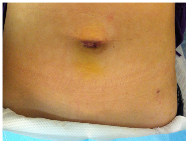
Fig. 2. Esthetic appearance of scars at the umbilicus and left lower quadrant in a patient after surgery with a modified three-port hidden scar surgical approach.