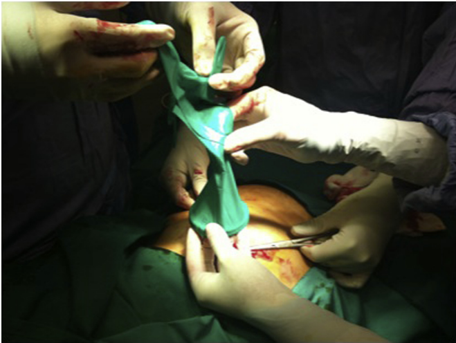
Fig. 1. The Alexis wound retractor is inserted into the peritoneal cavity after making the umbilical incision. The surgical glove is then applied over the outer ring of the Alexis wound retractor in our self-constructed single-port system.

The patient was discharged on the 5 th postoperative day after an uneventful recovery. She returned for outpatient follow up 3 weeks later and the surgical wound had healed well. The final histological results revealed that both tubes and ovaries, as well as all 26 pelvic lymph nodes, were negative for malignancy. She was confirmed to have a FIGO Stage IA Grade 1 endometrial cancer.