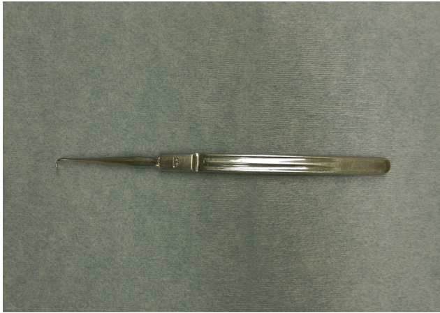
Fig. 1. Photograph of a skin hook.