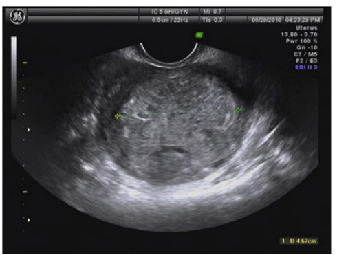
Fig. 1. The ultrasonography showed an heterogenic mass with high blood flow and low resistance vascularity.