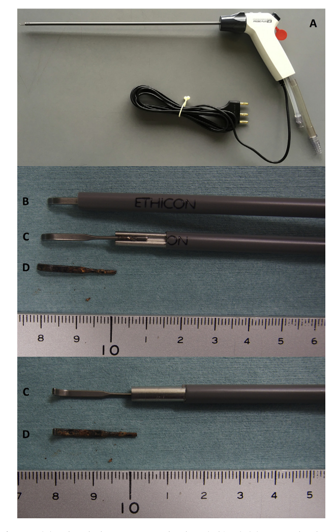
Figure 1. (A) Endopath electrosurgery probe plus II (Ethicon); (B) mono-polar electrosurgery suction and irrigation shaft with curved dissector electrode; (C) outer casing of the Endopath electrosurgery probe plus II (Ethicon, Tokyo, Japan) was cut; (D) the broken tip of mono-polar curved dissector electrode resected from the abdominal wall.

http://dx.doi.org/10.1016/j.gmit.2016.08.003