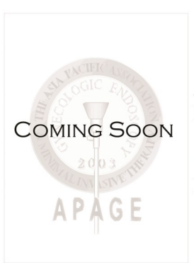
August, 2016 Bangkok, Thailand

APAGE Reproductive Surgery Hands-On Workshop