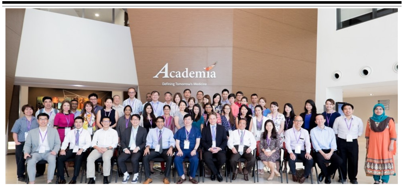
Group Photo - Faculty and Trainees