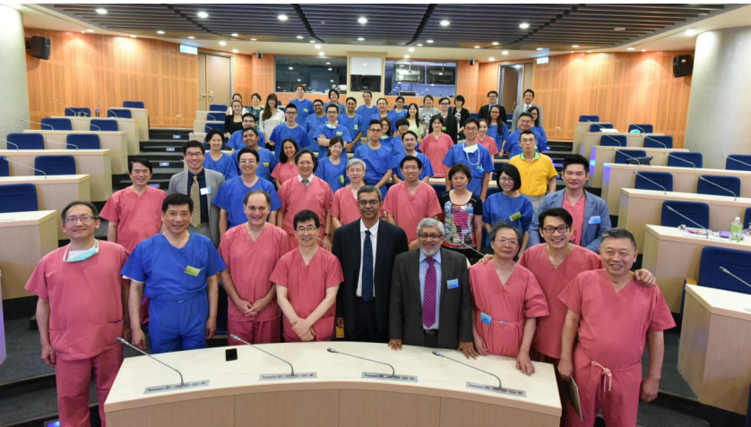
Group Photo - Faculty & Participants