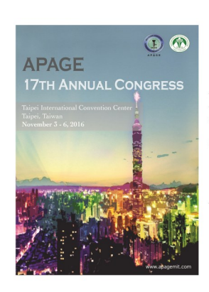
November 3 - 6, 2016 Taipei International Convention Center Taiwan