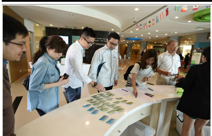
Venue - Registration Counter