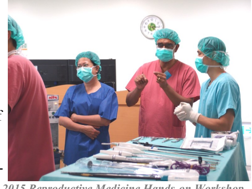
2015 Reproductive Medicine Hands-on Workshop

Gynaecological Endoscopy), AAGL (American Association of Gynaecological Laparoscopy) and