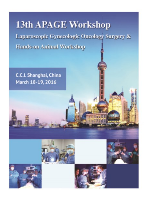
March 18 - 19, 2016 C.C.I, Shanghai, China

Techniques of Specimen Retrieval in Gynecology Workshop