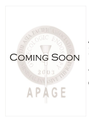
January, 2016 KK Hospital, Singapore

Techniques of Specimen Retrieval in Gynecology Workshop