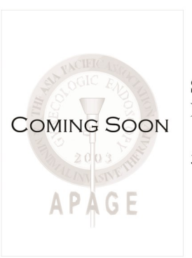
September 1 - 3, 2016 Nagasaki, Japan

10th Reproductive APAGE Cadaveric Hands-on Workshop