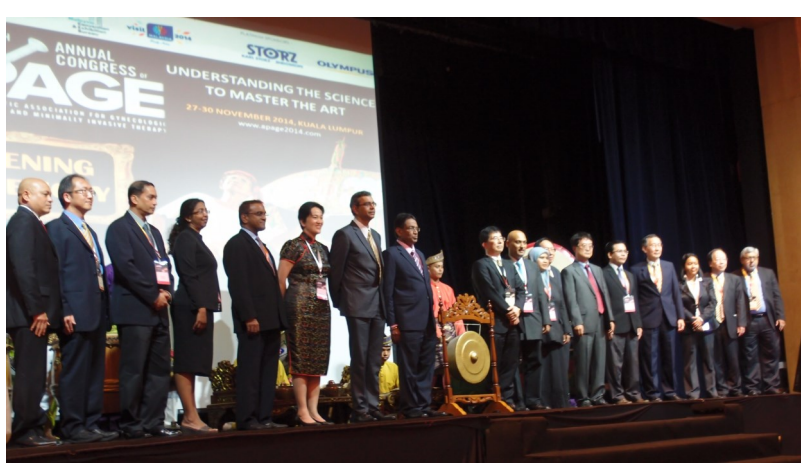
Opening Ceremony — Group photo of the Organizing Committee